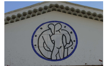
Chapelle Matisse, Vence

After the free lunch, drive towards Vence , the typical little Provencal town, with the old trees, the places, the little streets. You will visit the famous Rosary Chapel decorated by Henri Matisse. Let's admire the beautiful yellow, green and blue strain glasses; we are near the villa Le Rêve , where Matisse lived between 1946 and 1954. Overnight in Nice.