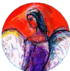
Musée Chagall, Nice

Our programme, "The Grand Museums of the Riviera", offers the opportunity to better understand our modern painting, starting from a chosen place, guided by a connoisseur. Thus, the luminous landscapes and charming cities will elicit the emotion that was expressed by the talented artists whose works we admire.