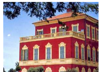
Céramique Théâtre Antique Jean Cocteau, Musée du Bastion, Menton/Fondation Maeght Saint Paul/Musée Matisse, Nice