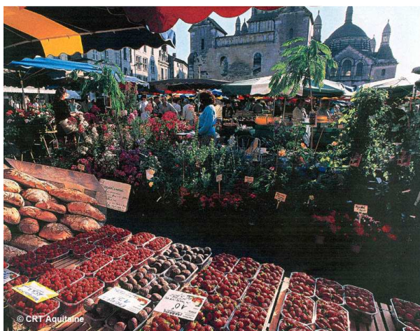
Market in Périgueux